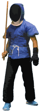
1 Parry against Latéral croisé

Parry the opponent's movements close to the body and counter attack (principle of parry/counter attack).