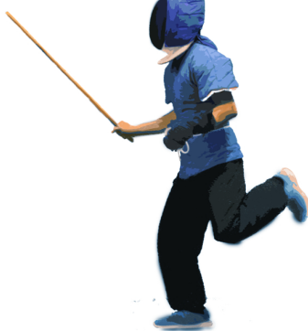
7 Dodge against lateral lunge