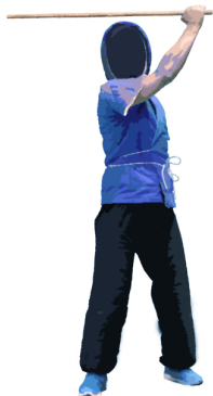
4 Parry against Brisé or Croisé tête