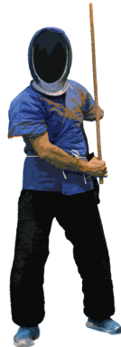
2 Parry against Latéral extérieur