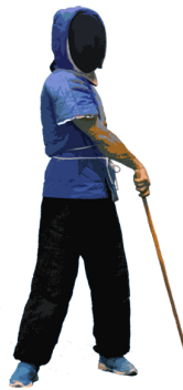
5 Parry against latéral extérieur lunge