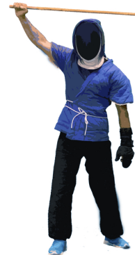
3 Parry against Brisé or Croisé tête