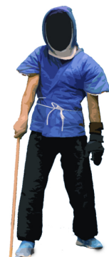
6 Parry against latéral croisé lunge